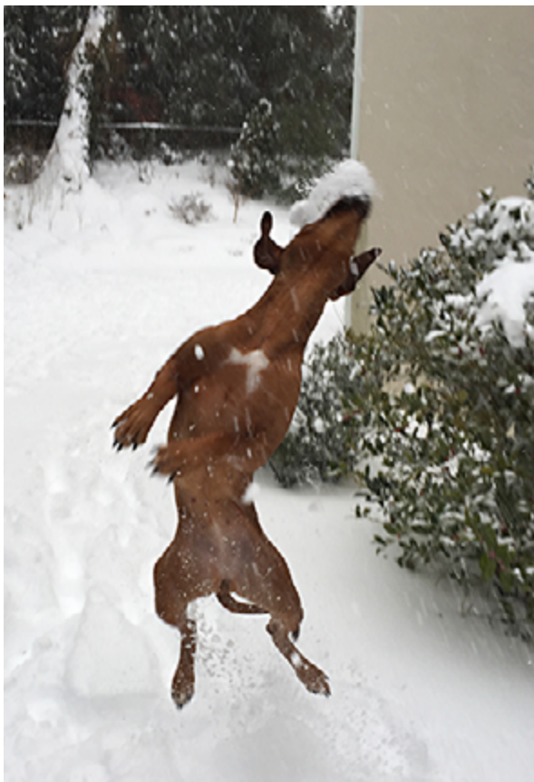
Asha Catches a Snowball © Heather Emmel