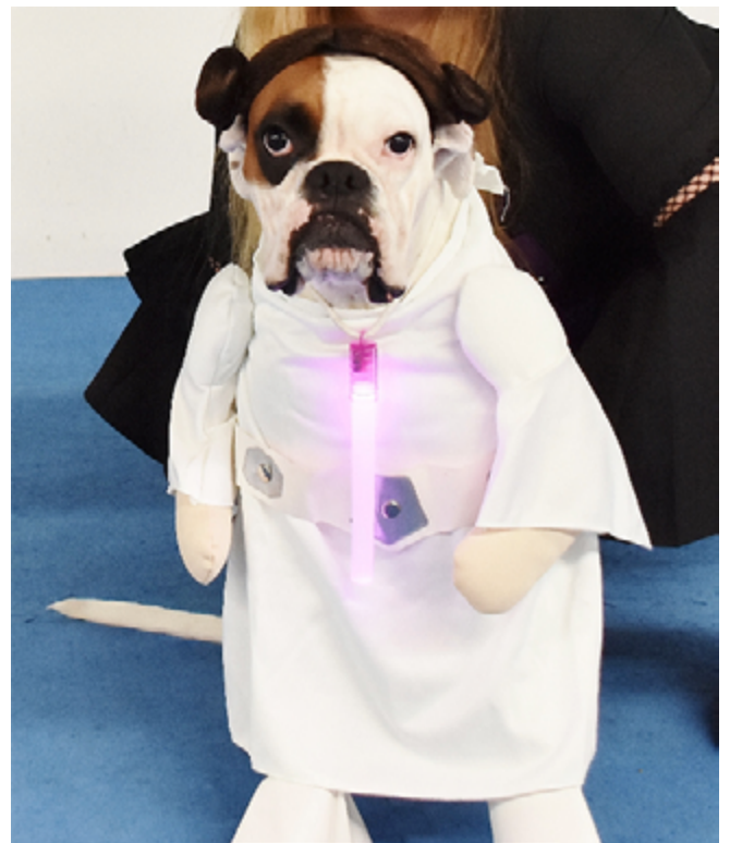
Clockwise from top left: Bobbing for Apples, Devil Dog, Princess Leia~ "May The Course Be With You!", and Lumberjack Dog.