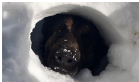
Dog Nose in Snow