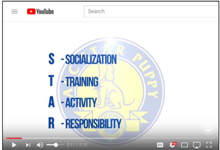
Scenes from a S.T.A.R. puppy class at PCOTC

PCOTC offers the S.T.A.R. Puppy Program through its Family Manners program. Your puppy's early months are a critical informative time during which your puppy learns to interact appropriately with different people, dogs and environments that the world has to offer. This class will help you make the most of this developmental window and build the foundation for a friendly, confident, well-mannered adult dog. Off-leash play will be at the discretion of the instructor. In order to be eligible for the AKC S.T.A.R.® Puppy Test puppies must attend six weeks of classes. Class limit 8. Please check our class schedule via our website, http://www.pcotc.org , for availability/times of STAR Puppy classes.