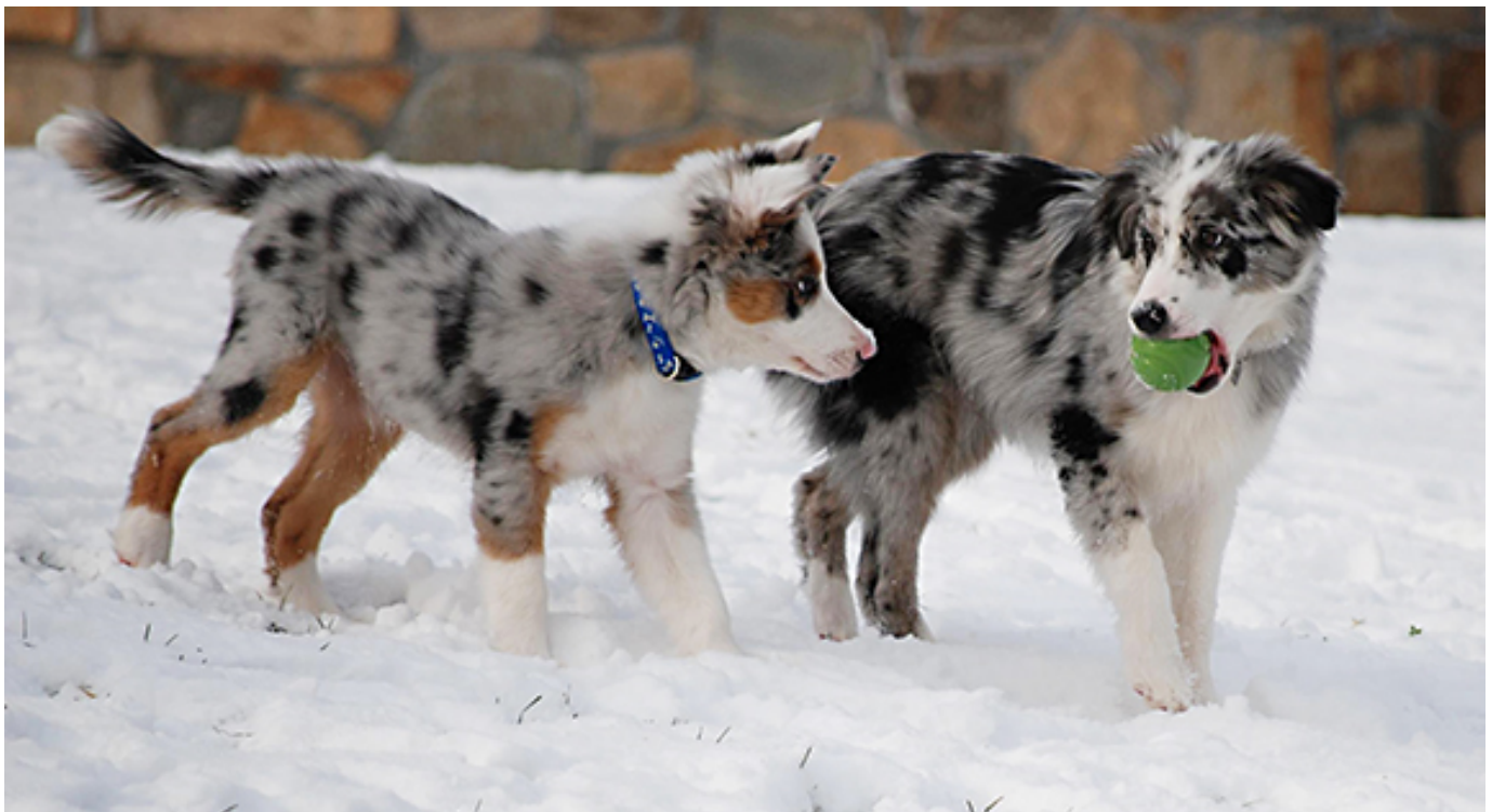
Spur & Jack as puppies