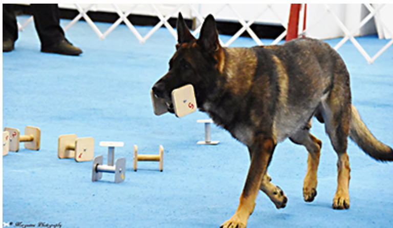
Clockwise from above: Bob Amen with thank-you cake, dumbbell retrieve, broad jump, bar jump.