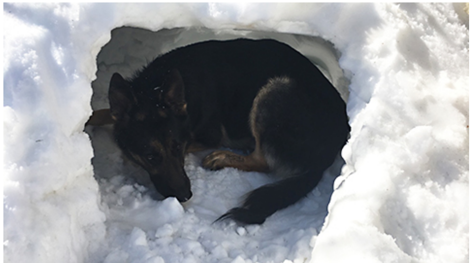
A cozy dog bed in the snow