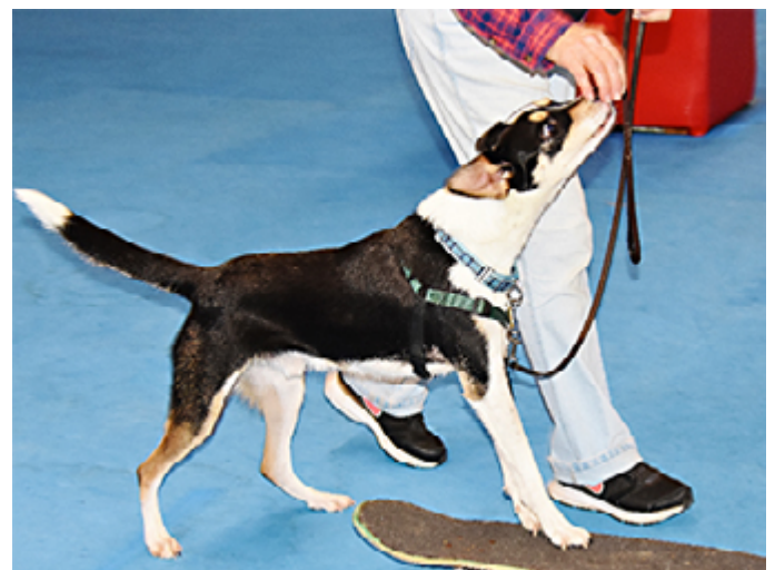
Clockwise from top left: Pumpkin "dog," Bumble Bee Papillon, Table and Play Area, Skateboarder, Puppy Flower, and Unicorn Petit Basset Griffon Vendéen meets a Ballerina Poodle