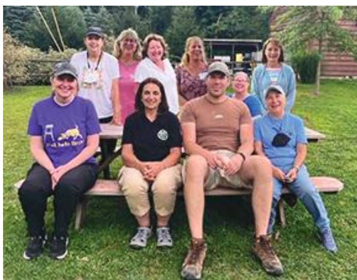
2022 PA Nosework Camp

Great fun enjoyed by instructors and campers together!